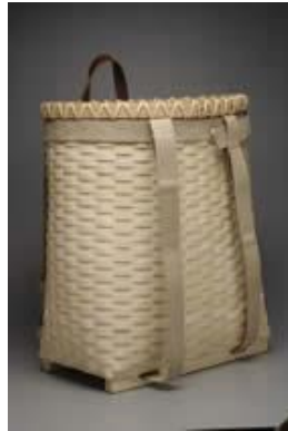
#2 Pack Basket (Medium)