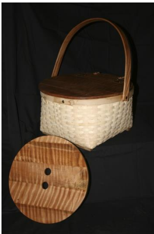
#3 Lidded Double Pie Basket 10" x 10" x 8" $160.00