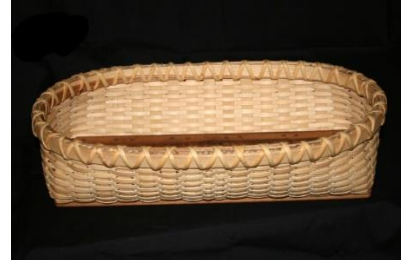
#2 Bread Basket 5" x 15" x 5" $123.00