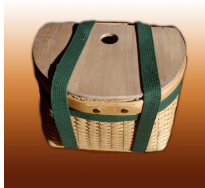
#2 Lidded Creel Basket 5" x 11" x 7" $160.00