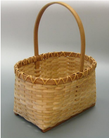
#1 Market Basket – Fixed Handled