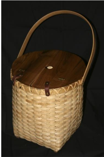
#1 Lidded Knitting Basket 8" Wide x 8" Long x 12" High $160.00

Lids offered will be in cherry, walnut or tiger maple.