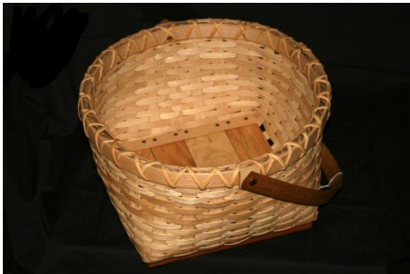
#3 Round Utility Basket 10" x 10" x 5" $123.00