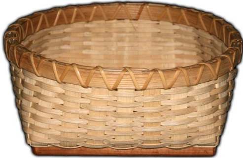
#1 Roll Basket 8" Wide x 8" Long x 5" High $123.00