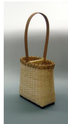
#4 Wine Basket