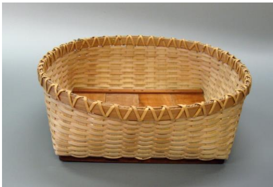
#3 Round Tray Basket