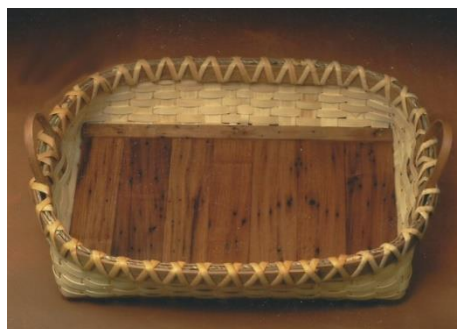
#5 Casserole Basket