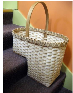
#6 Stair Basket

7" Wide on each section. 8" Long on tall side and 7" Long on short side. Height is 15" tall on one side and 8" tall on small side.