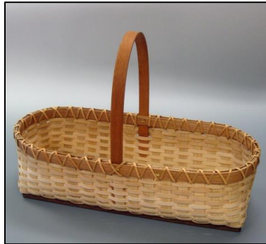
#5 Herb Basket