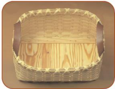
#4 Laundry Basket