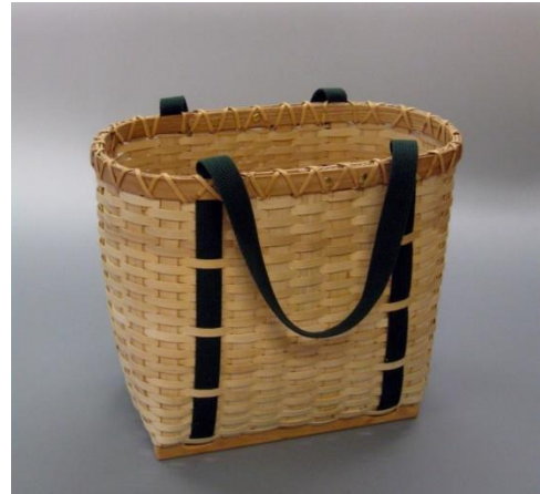
#2 Tote Basket