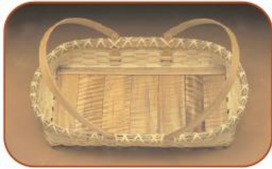
#1 Garden Basket or Double Pie Basket