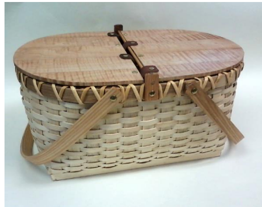
#4 Lidded Picnic Basket 9" x 15" x 8" $160.00

*Double pie and picnic baskets will have brass hinges and leather straps for the lid with wooden swing handles*